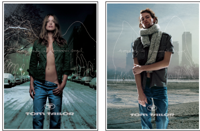
Tom Tailor – X-Mas Promotion 2003