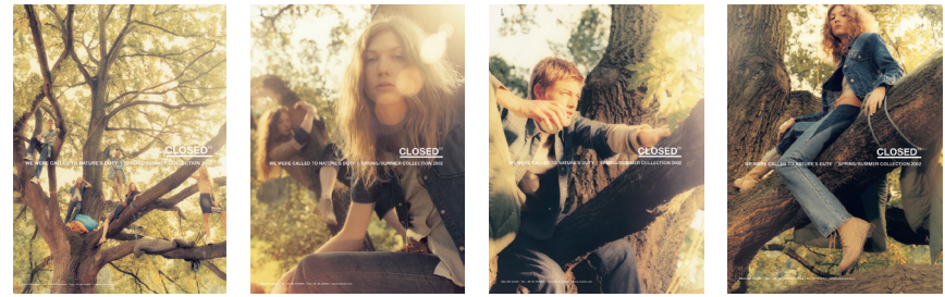
Closed – Campaign S/S 2002