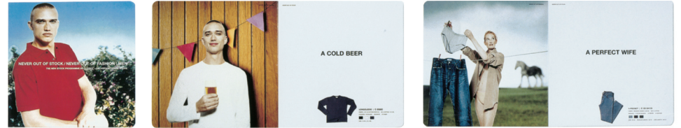
Closed – NOS Brochure – shortlisted at ADC 2002