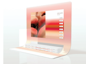
Prada Beauty – Window Display