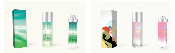
ZARA – Summer Fragrance 2004