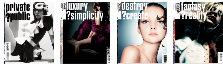
Sleek – our magazine – received two silver and two bronze awards at ADC 2004