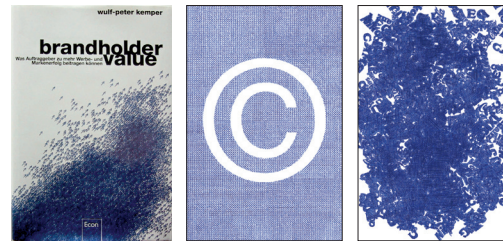
Brandholdervalue – received silver award at ADC 2003