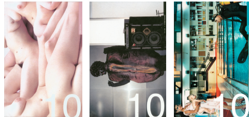
10 – our little magazine