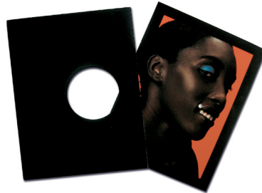
Hotel – Brochure A/W 2002/03