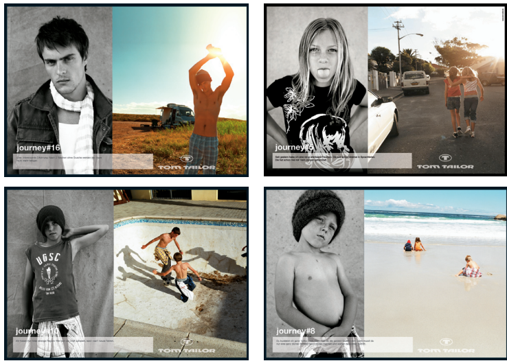
Tom Tailor – Campaign S/S 2004